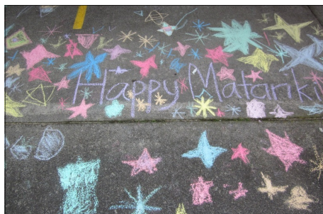
See the Matariki decorations in the Junior Quad

Please have children who are in the parade dressed and ready in the hall by 8.45. Girls may use Room 5 to change and boys the library. All children have been asked to bring a small plate of food to be taken to the classroom.